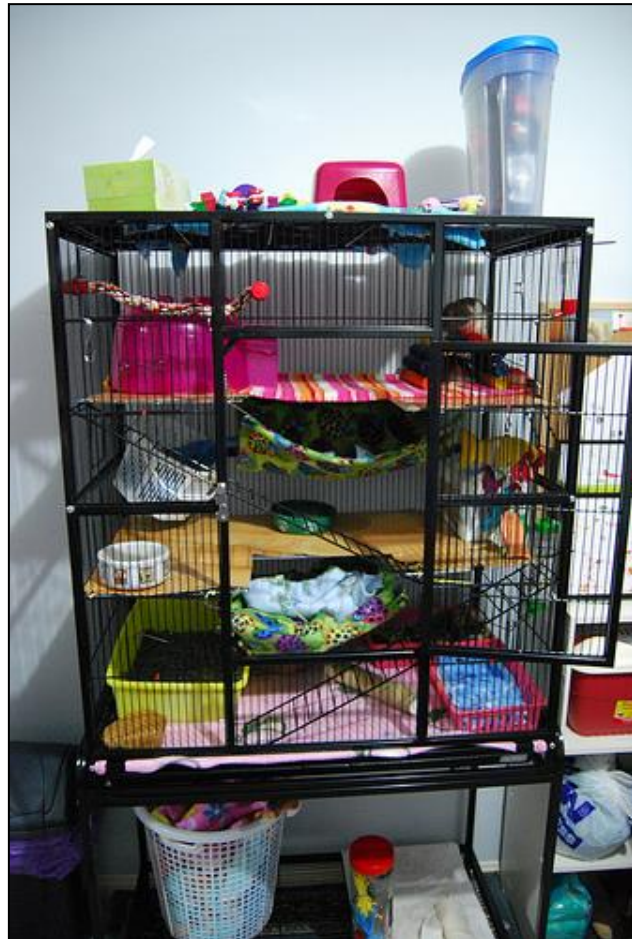
Avi One Cage with levels and ladders added to make it suitable for rats.