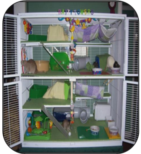
Rat Cage owned by Wendy C

Rats also need good quality food, not the products that are sold in supermarkets as “rat mixes”. The ideal diet consists of a quality rat pellet, plus a variety of fresh foods. Please see the Diet Chapter in the AusRFS care book or contact us for advice.