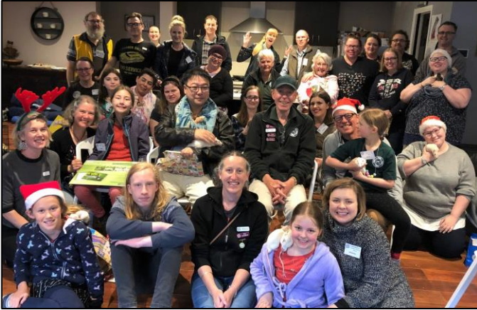
AusRFS Christmas Party

Members and their rats enjoy a variety of social gatherings. All are friendly, relaxed days with great company, great food and lots of “rat chat”. Rats are always the centre of attention of course, and they enjoy these days as much as their owners do.