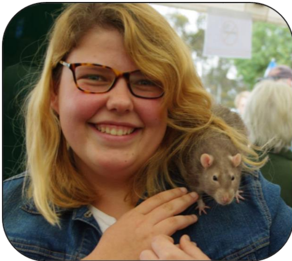
Visitors to our display getting to know some rats.

Once people are sure that rats are the right pet for them, we can help them acquire their new companions, and everything they need.