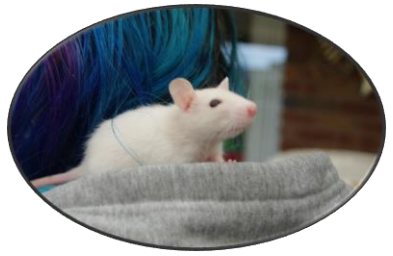
AusrRFS Rescue rat