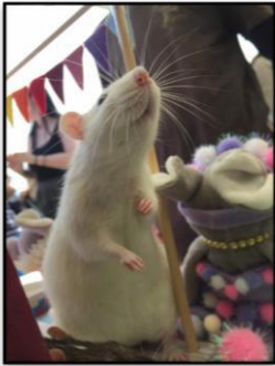
Orin owned by Rob B & Louise G.

Rats are the complete opposite to what most people think. People are often surprised to learn that pet rats are sweet natured, gentle, affectionate, clean, social, curious, playful, happy and smart.